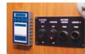
Keyless Remote Drawer Touch Pad

When you enter your vehicle, there's a touch pad to simply select to open any one or all 5 drawers. Once remotely activated the drawer system looks after itself by automatically releasing and activating the pneumatic opening mechanism that unlocks and extends the drawer at waist level for you. Each drawer has a Locking Lid that doubles as a tabletop or convenient workbench, as drawer illustrations 1 - 5 below.