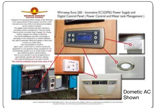
Euro 260 - Innovative EC325PSU & Control Panel

Integral to the physical interior design of the Wirraway is it's unique EC325 Power Supply Unit that is both innovative and one of the most advanced available, yet it's simple to operate. It can be programmed to automatically operate your internal and external lighting, your airconditioning and/or diesel heating as well as your alarm system. It has a digital control display with easy to operate selection, providing system management of all power, charging, solar, water, and battery voltage.