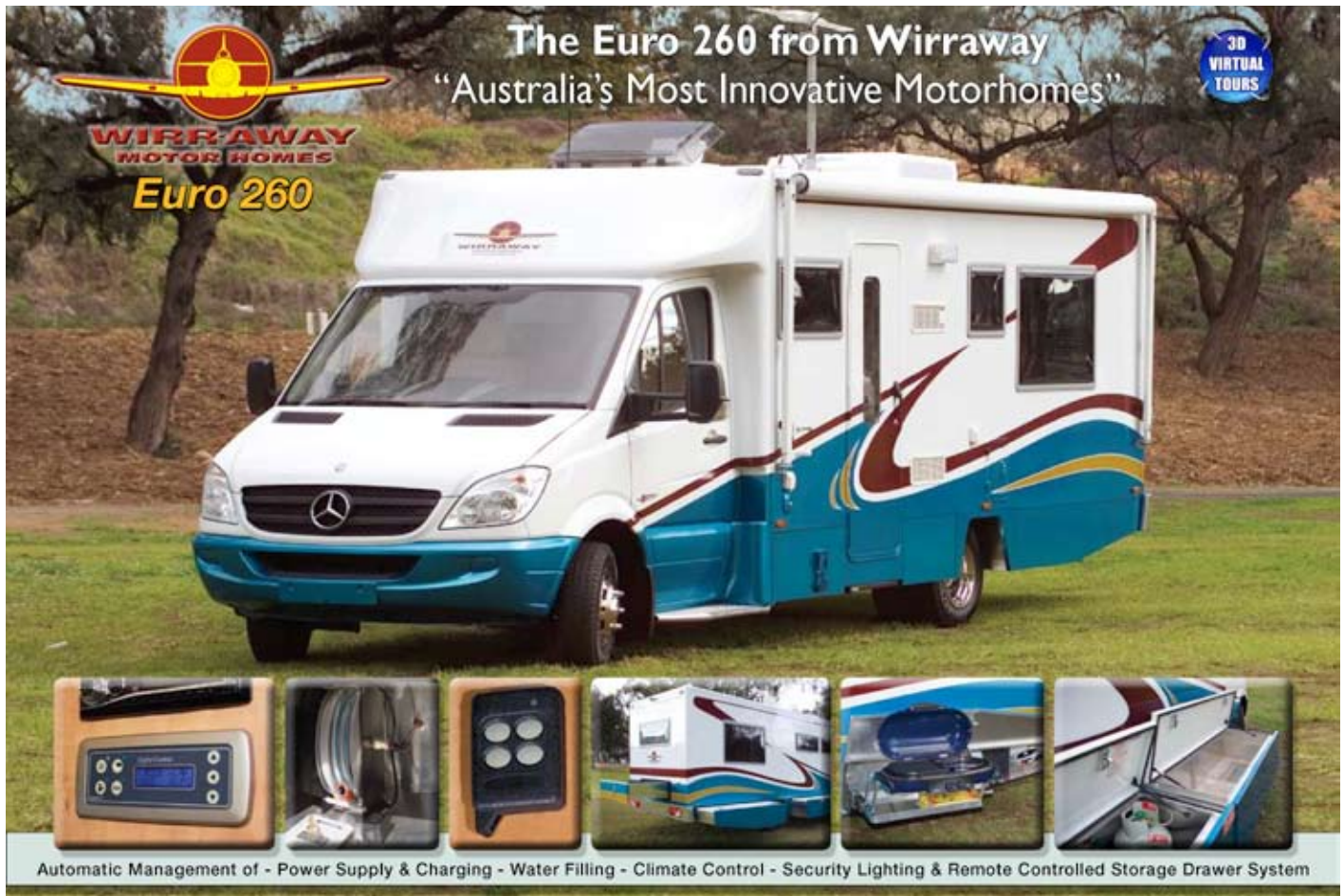
Automatic Management of - Power Supply & Charging - Water Filling - Climate Control - Security Lighting & Remote Controlled Storage Drawer System

“Australia’s Most Innovative Motorhomes”