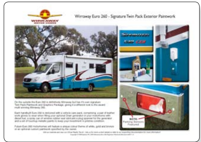
Euro 260 - Two Pack Paintwork

At the rear the largest drawer allows external access to the Double bed storage. This drawer is big enough for your outdoor chairs, table, annex walls and more.