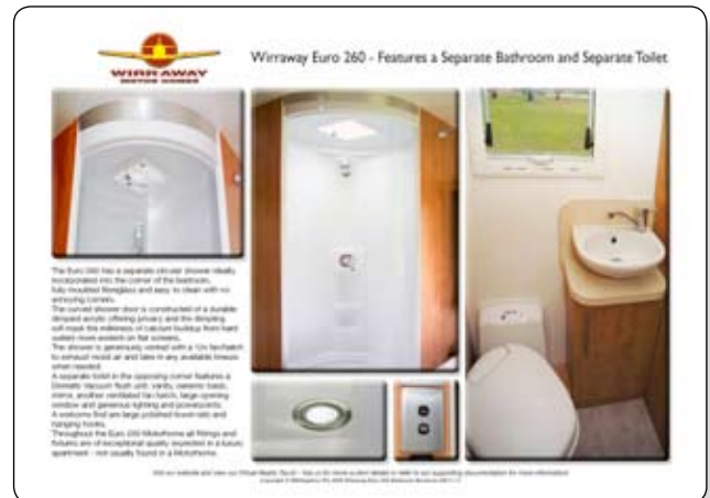
Euro 260 - Separate Shower & Separate Toilet