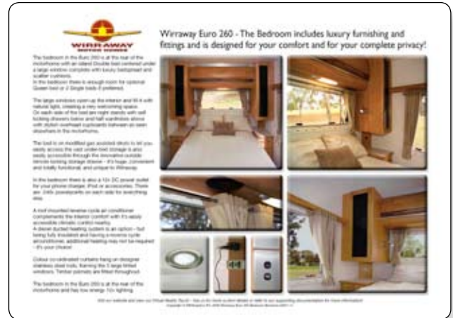
Euro 260 - Private Bedroom - Single beds optional!