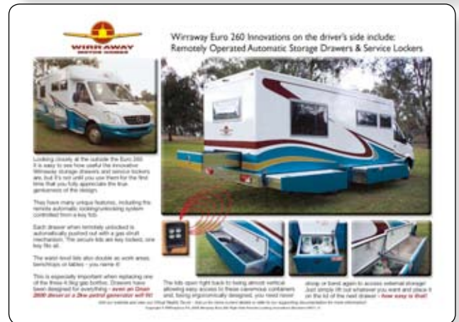
Euro 260 - Innovative Automatic Drawer System