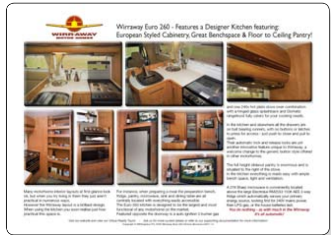
Euro 260 - Opulent European Styled Interior

The large laminated tinted windows throughout feature inbuilt solar blackout screens and complement the thermal performance of the Motorhome, being constructed from a composite hi-efficiency closed cell urethane foam panel with fibreglass laid up and vacuum sealed, more efficient than Styrofoam. The walls and roof panels are strong, thermally efficient and maintenance free. Insect screens are also included.