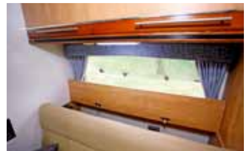
Clockwise from top: Extremely roomy interior; storage behind lounge seat; note the casual hour glass-shaped table.